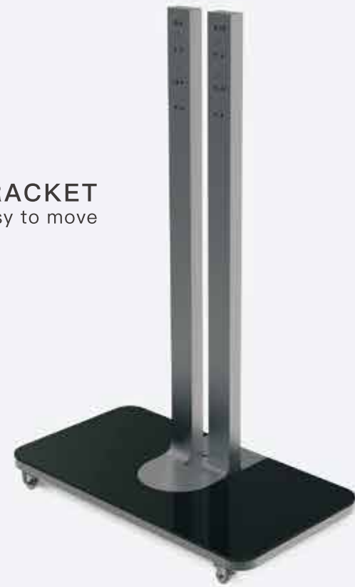
MOBILE BRACKET Strong and stable,easy to move