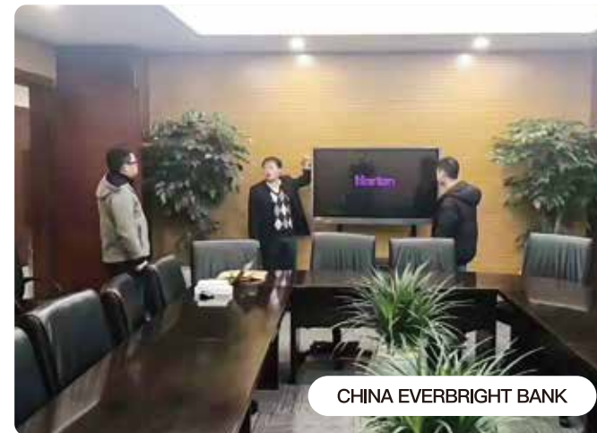
CHINA EVERBRIGHT BANK