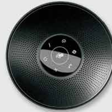
MICROPHONE 360-degree sound acquisition noise reduction