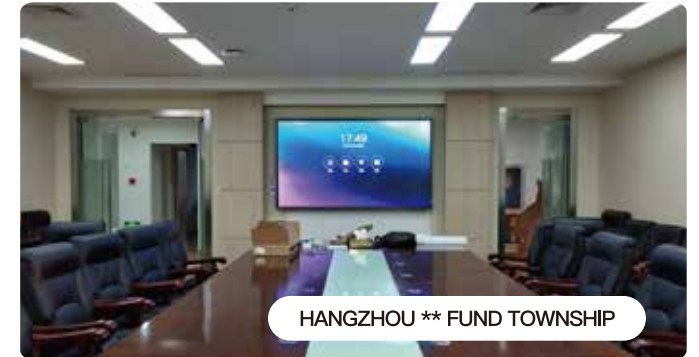
HANGZHOU ** FUND TOWNSHIP