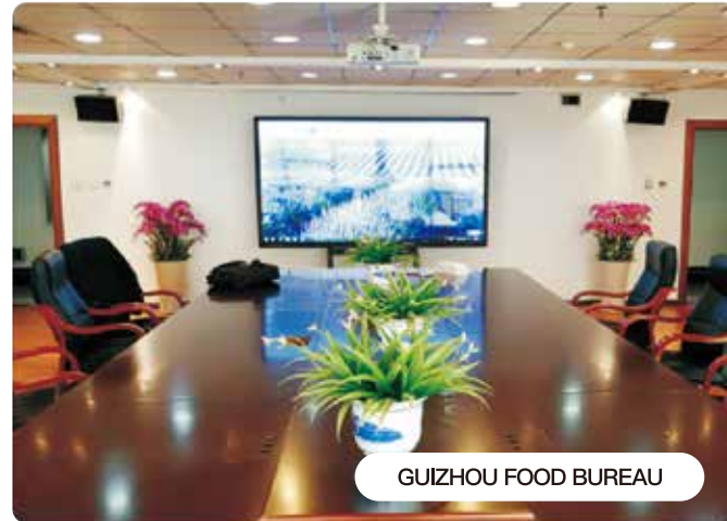
GUIZHOU FOOD BUREAU