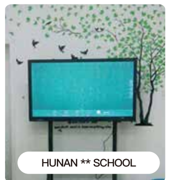
HUNAN ** SCHOOL