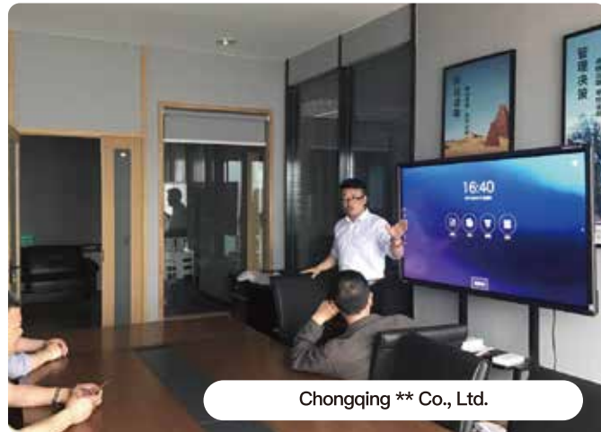
Chongqing ** Co., Ltd.