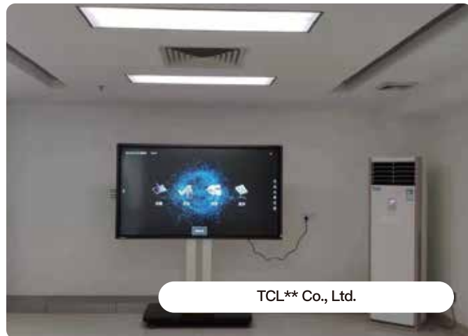
TCL** Co., Ltd.