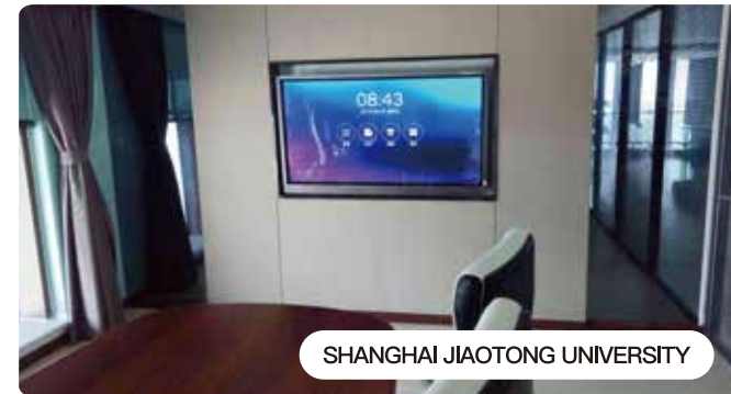
SHANGHAI JIAOTONG UNIVERSITY