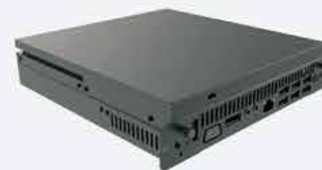
OPS COMPUTER Powerful performance, ready to use instantly