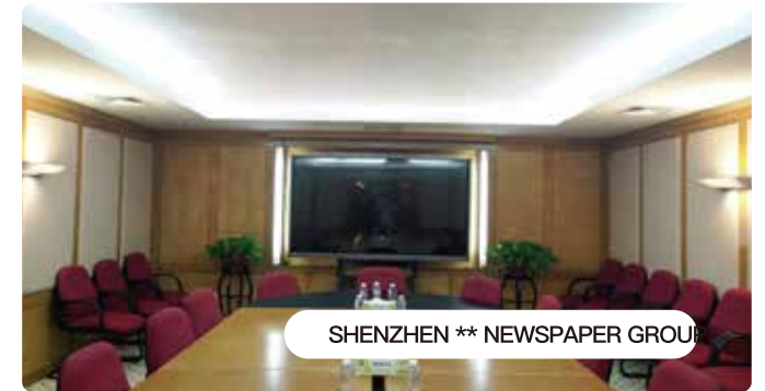
SHENZHEN ** NEWSPAPER GROUP