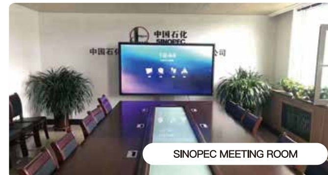
SINOPEC MEETING ROOM