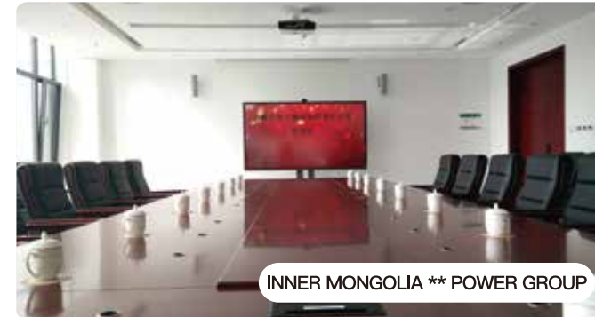
INNER MONGOLIA ** POWER GROUP

When brainstorming, enterprises use Horion interactive flat panel to write and discuss, freely express their will, and easily capture ideas, which not only improves the efficiency of the meeting, but also allows inspiration to collide at any time and stimulate the potential of Innovation.