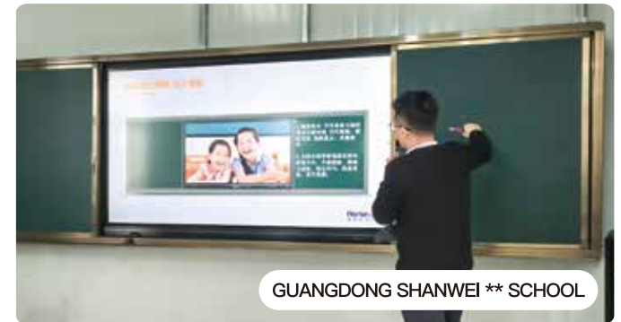
GUANGDONG SHANWEI ** SCHOOL