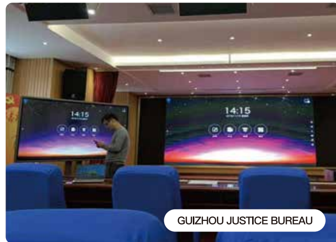
GUIZHOU JUSTICE BUREAU