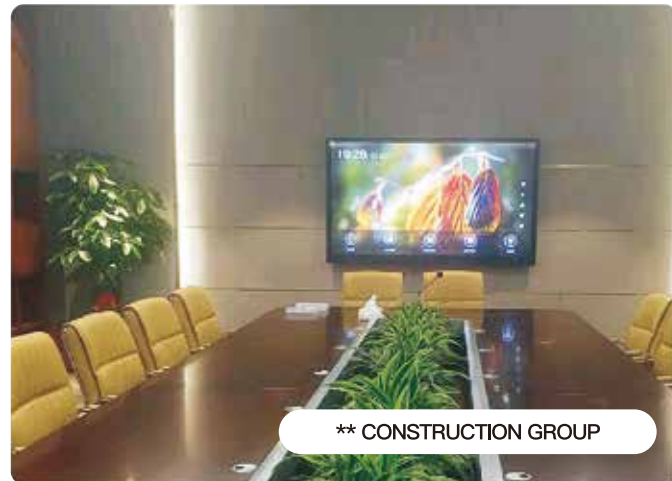
** CONSTRUCTION GROUP