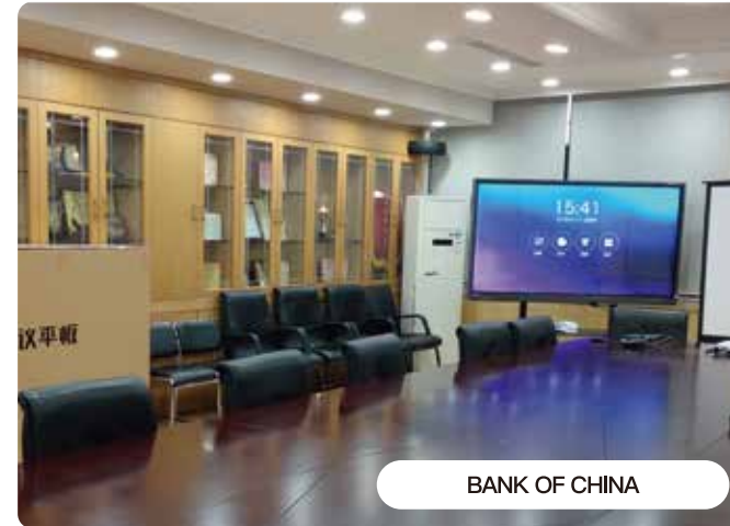
BANK OF CHINA

More and more banks introduced Horion interactive flat panel. With its help, they realize innovation and upgrade services to provide customers with efficient and convenient all-round services.