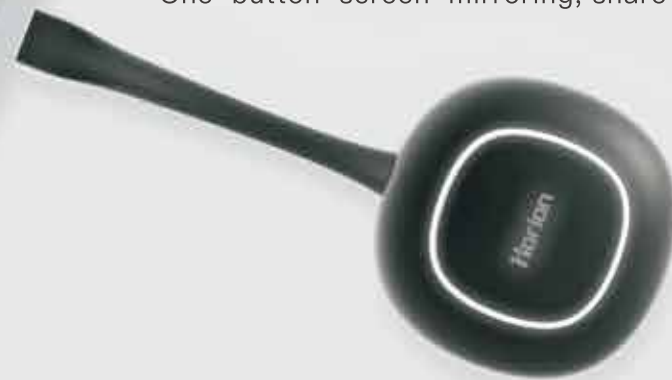
SCREEN MIRRORING DEVICE One button screen mirroring, share in real time