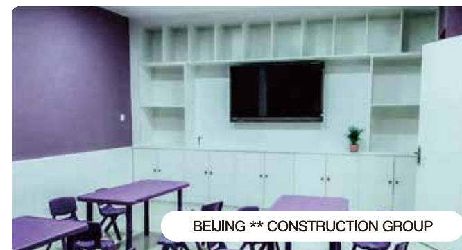
BEIJING ** CONSTRUCTION GROUP

Only after advanced technical products are deeply integrated with teaching they can really bring changes in teaching. Horion interactive flat panel contributes to education informatization by providing high-quality products and services.