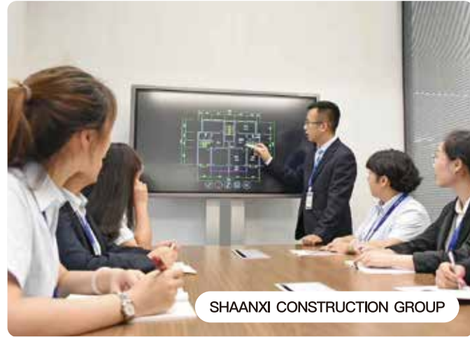
SHAANXI CONSTRUCTION GROUP

Horion interactive flat panel supports multi-touch function. You can handwrite to input words by touching the screen, play videos of real estate industry, and search and compare the house type as you need on the flat panel.