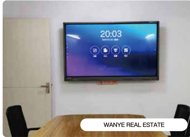
WANYE REAL ESTATE