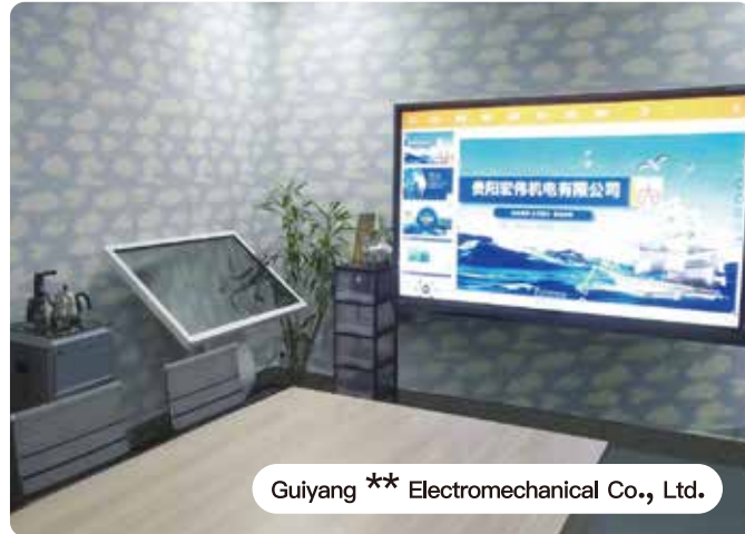
Guiyang ** Electromechanical Co., Ltd.

As technology collides with tradition, Horion interactive flat panel injects new vitality into the manufacturing industry, brings more convenient and efficient interactive conference experience, and improves the efficiency of team communication and collaboration.