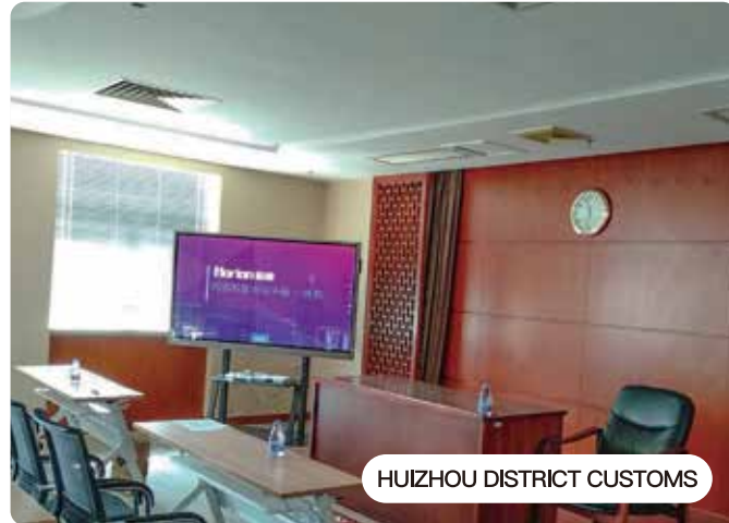
HUIZHOU DISTRICT CUSTOMS

Horion interactive flat panel walked into government agencies and institutions, streamlining business processes, improving efficiency, and helping build a more efficient service-oriented government.