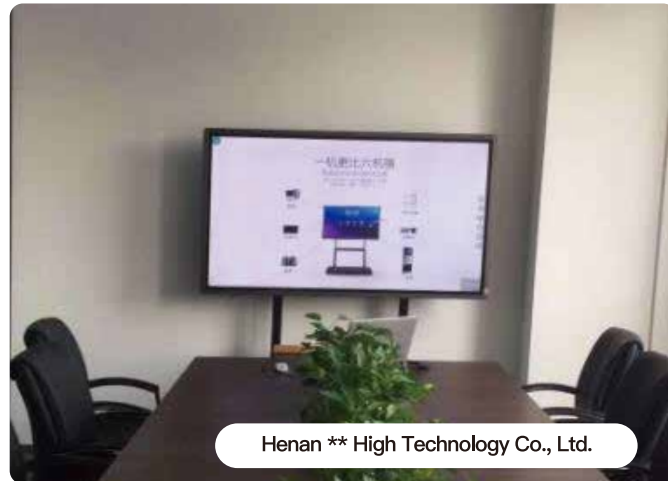
Henan ** High Technology Co., Ltd.