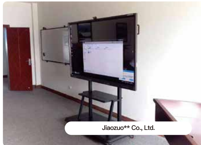
Jiaozuo** Co., Ltd.