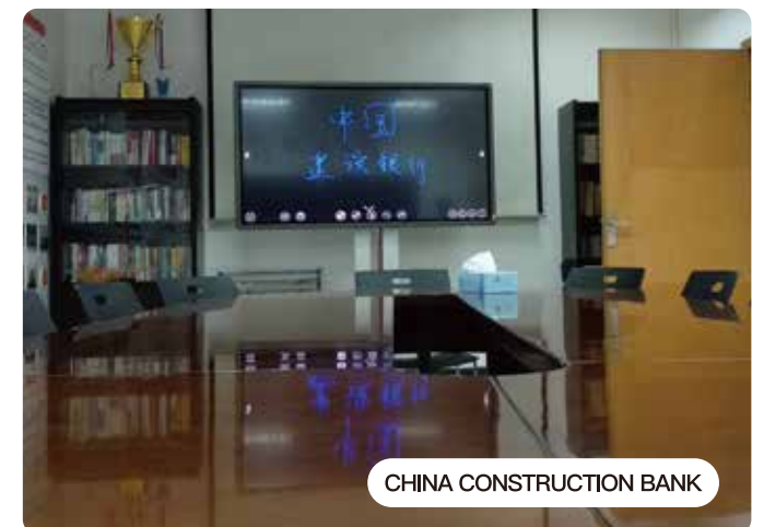
CHINA CONSTRUCTION BANK