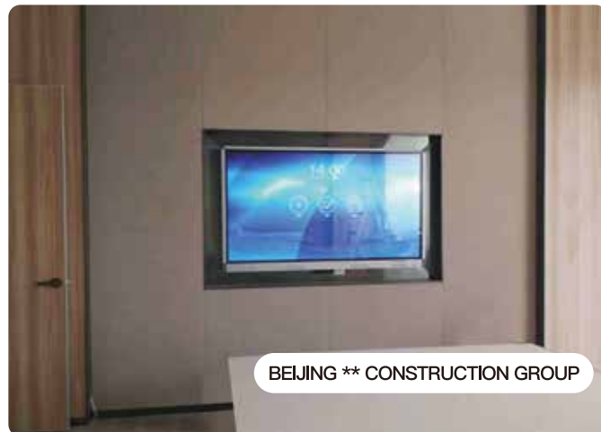
BEIJING ** CONSTRUCTION GROUP