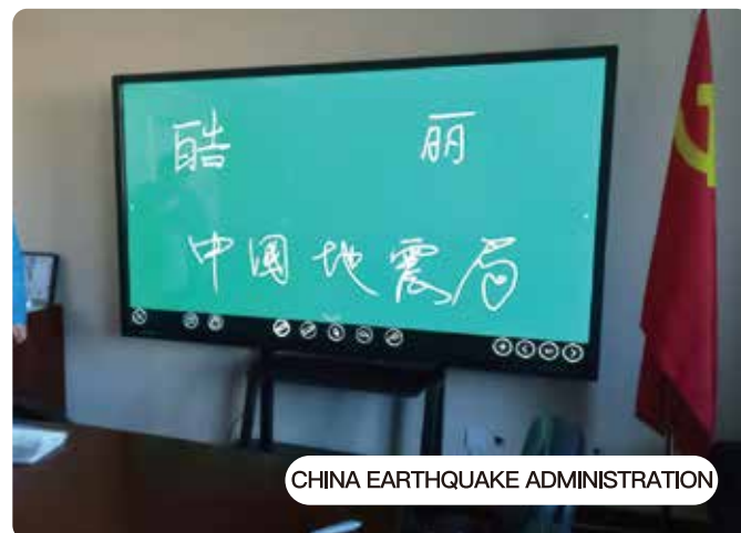
CHINA EARTHQUAKE ADMINISTRATION