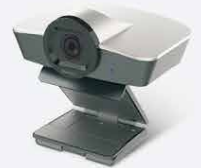
CAMERA HD lens,autofocus