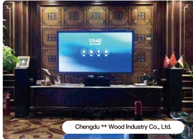
Chengdu ** Wood Industry Co., Ltd.