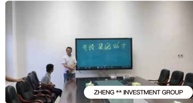
ZHENG ** INVESTMENT GROUP