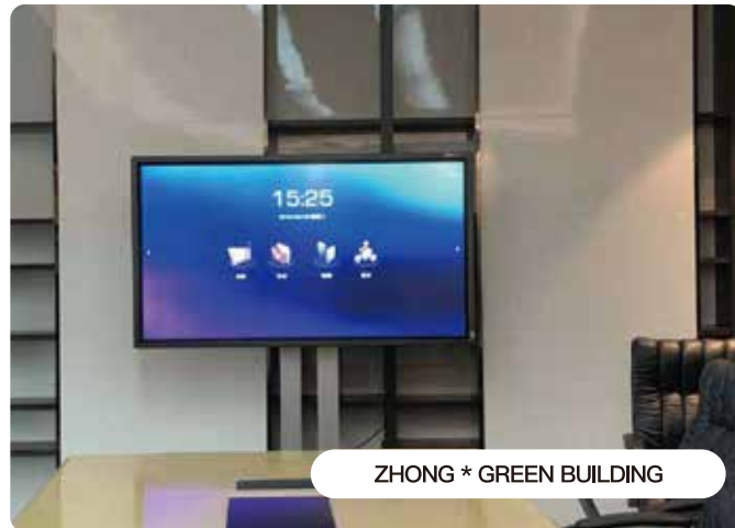
ZHONG * GREEN BUILDING