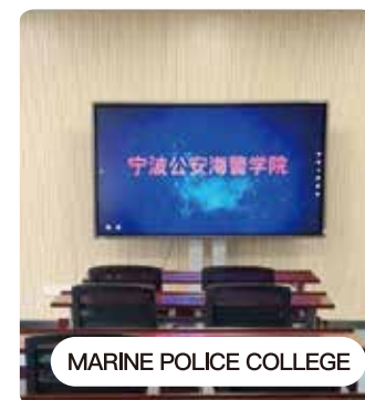
MARINE POLICE COLLEGE