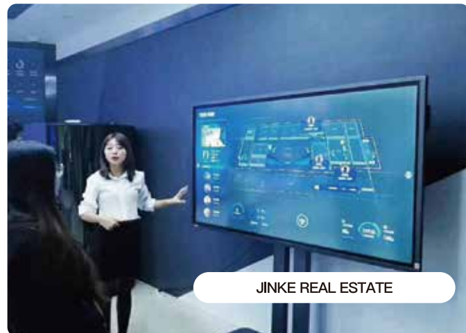
JINKE REAL ESTATE